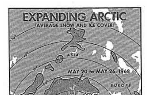
New York Times May 21, 1975 pg. 92